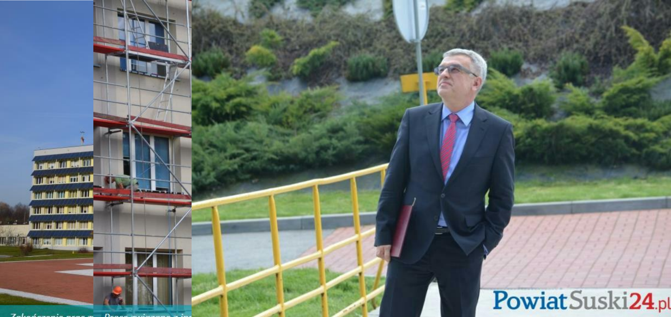
Zakończenie prac z... Prace związane z instalacją modułów fotowoltaicznych - 10.09. 2015 r.